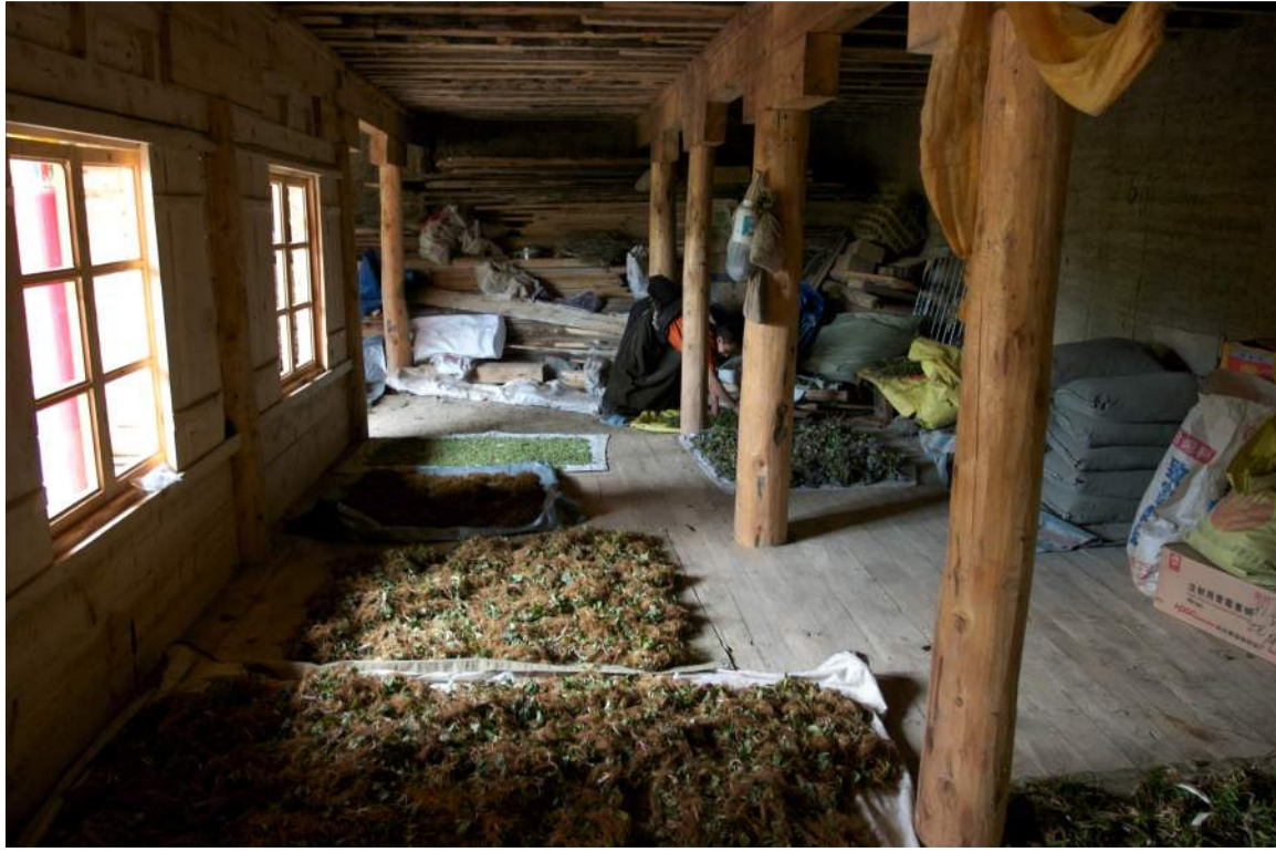
Herbal medicines in the clinic