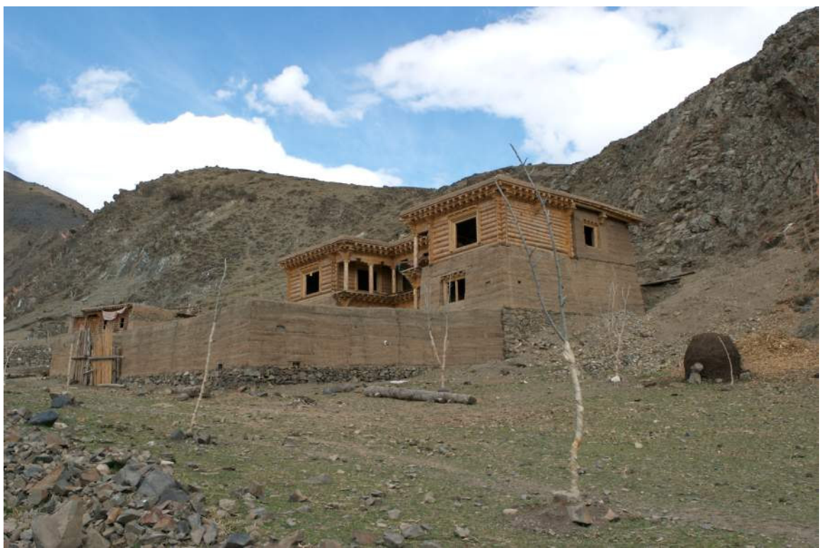
The school under construction in Rigul, Kham, Tibet. 2006