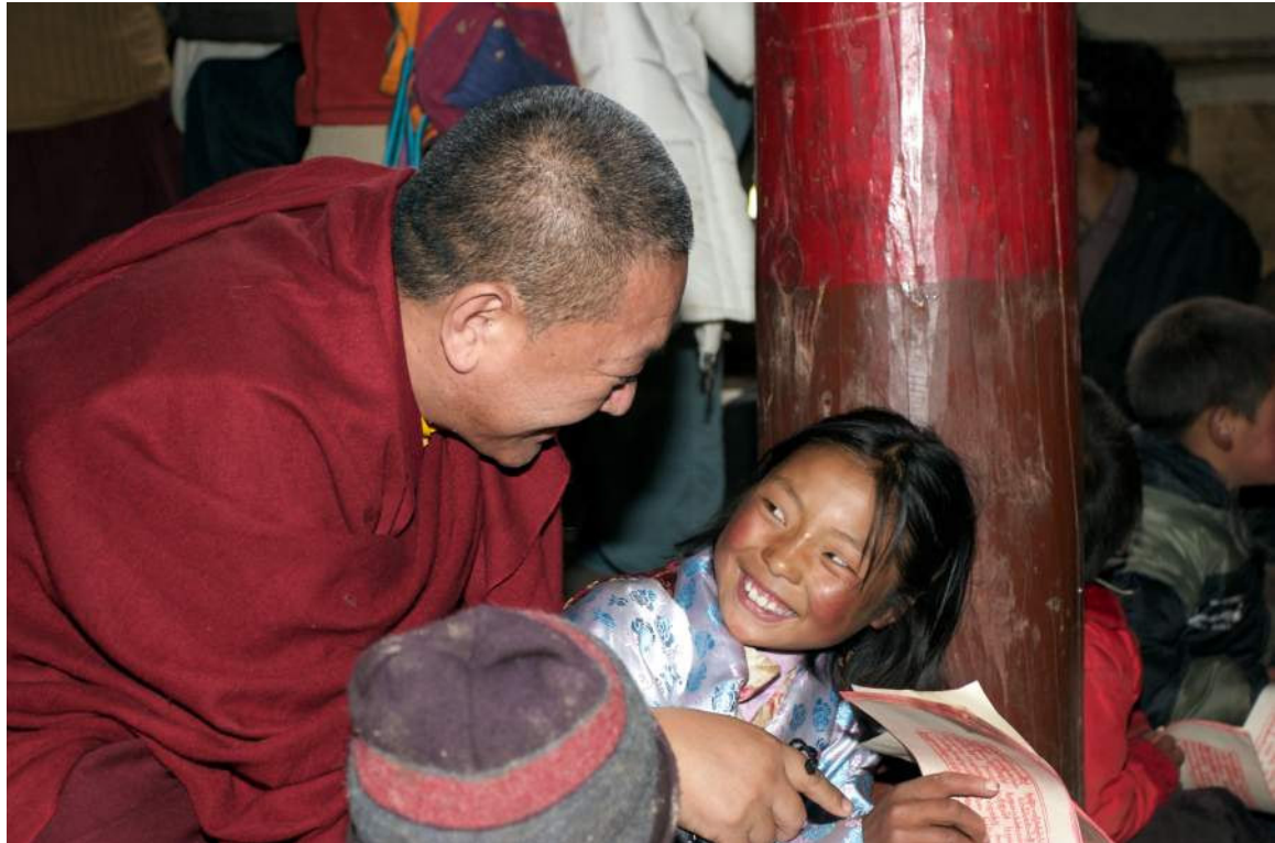
A welcome visitor: the Lama Ringu Tulku, a native of Rigul, and the initiator and guide of the projects