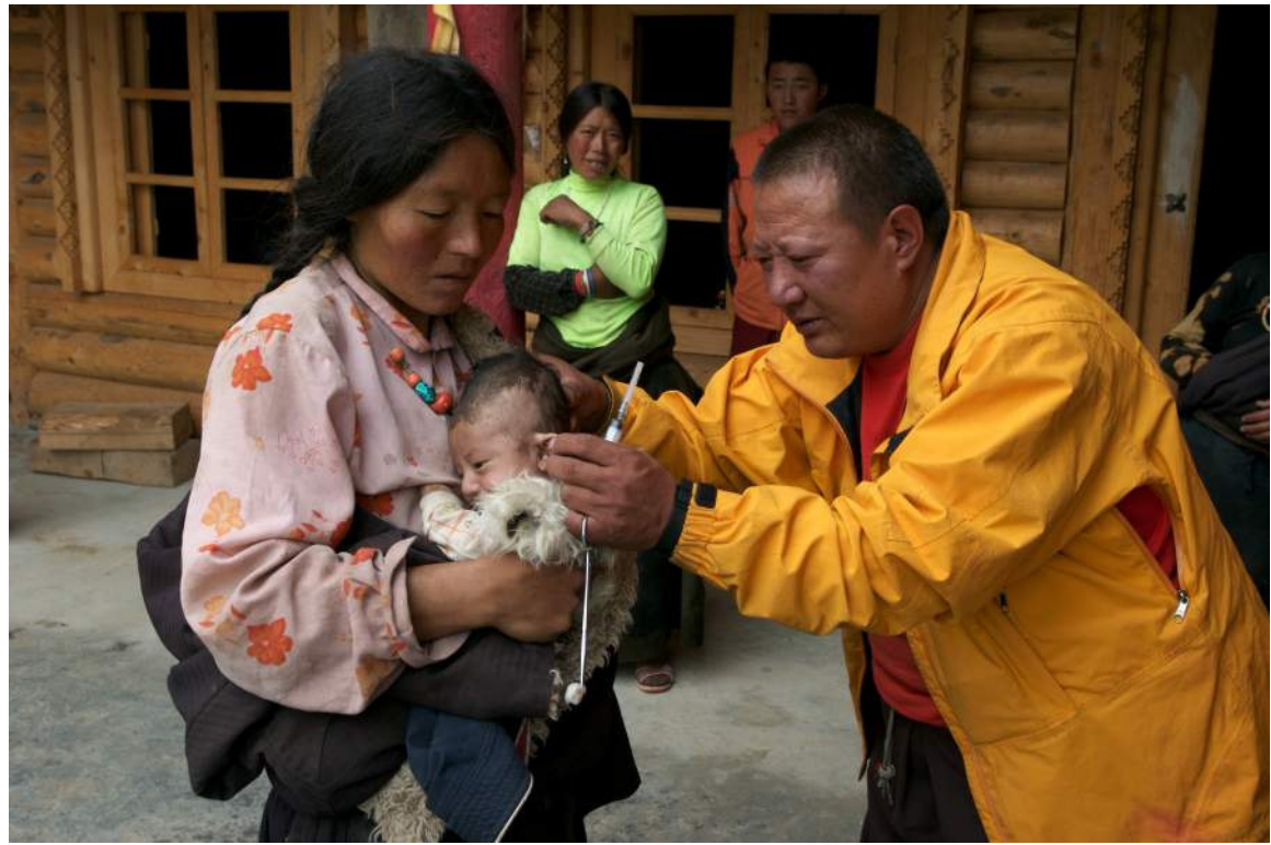
The resident doctor looking after a child