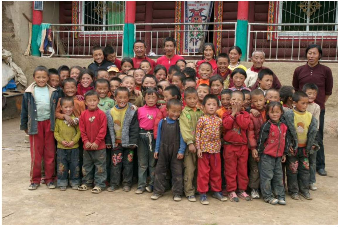
Roll call !