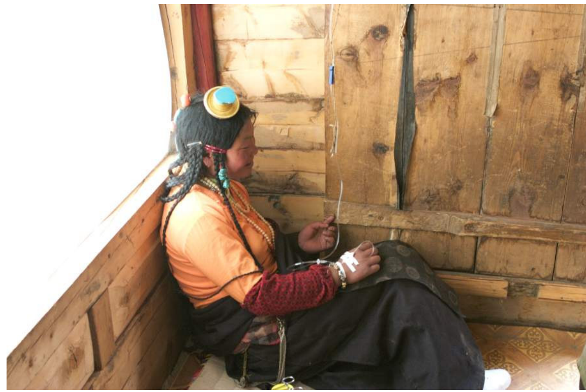
A patient in the clinic