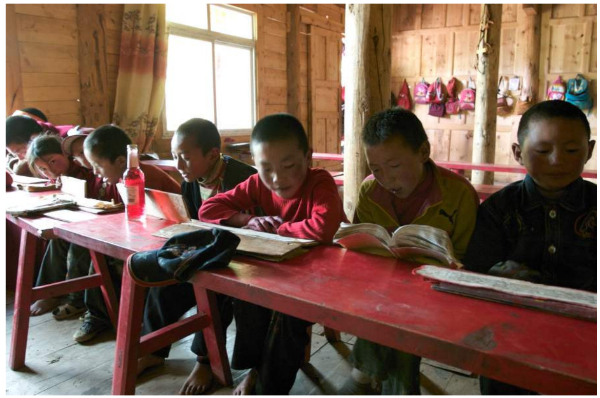
Classes are now held every day