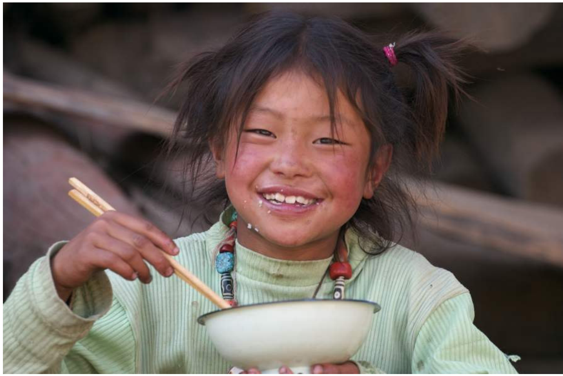
Lunch break !